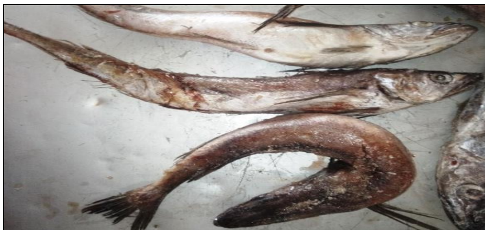
Fig 1: Fish species Gadus morhua (cod) used for the study

In the first survey, 1 coldroom (a major distributor) was purposively selected from Owerri municipal as control experiment. From the cold room (as control), ten (10) specimen of the fish species were randomly sampled for sensory and chemical quality status. The same design was also applied to the second survey (open markets) however, there were fishes from three open markets randomly surveyed per zone in the state. The experiments were carried out in four month periods spanning a year to cover all climatic seasons. The design layout of the experiment is as presented in tables 1.