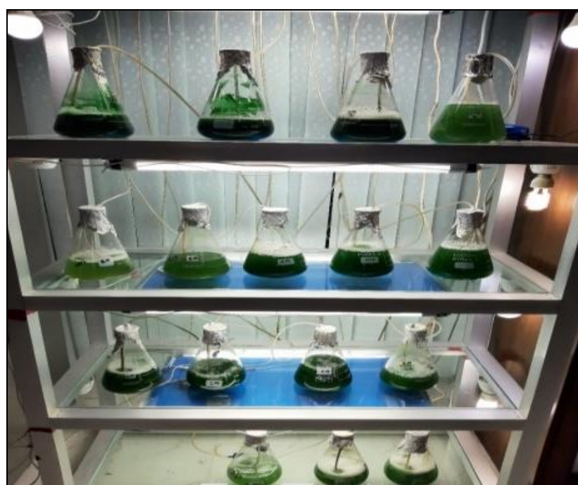
Fig 1: Setup for Spirulina culture

The two types of media viz. Fish Meal Medium (FMM) and Kosaric Medium (KM) were used for the culture of S. platensis . Under this experiment, FMM and KM treatments were performed each of 3 replications. For both the culture media 12 days culture period was maintained.