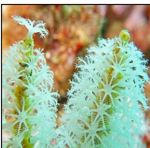
Fig 5: Carijoa riisei