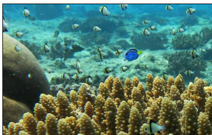
Fig 2: Coral Biodiversity

shallow waters of our reefs though they are present in deep waters from where they are collected for export. The soft corals or Alcyonarians are dominant among the hard corals in Andaman and Nicobar Islands and they do occur in Gulf of Mannar and Gulf of Kutchh [1].