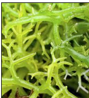
Fig 4: Kappaphycus alvarezii

Illegal and destructive fishing practices are also responsible for such type of damage. Many banned malpractices like blast fishing are still going on. Overfishing causes the removal of herbivorous fishes that encourages excessive algal growth in the absence of these grazers. In such a way coral reef ecosystem is shifted to algal dominated barren without any fish and corals. Bio-invasion of macroalgae Kappaphycus alvarezii (Fig 4) and snowflake octocoral Carijoa riisei (Fig 5) have caused detrimental impact on reef corals [6, 11].