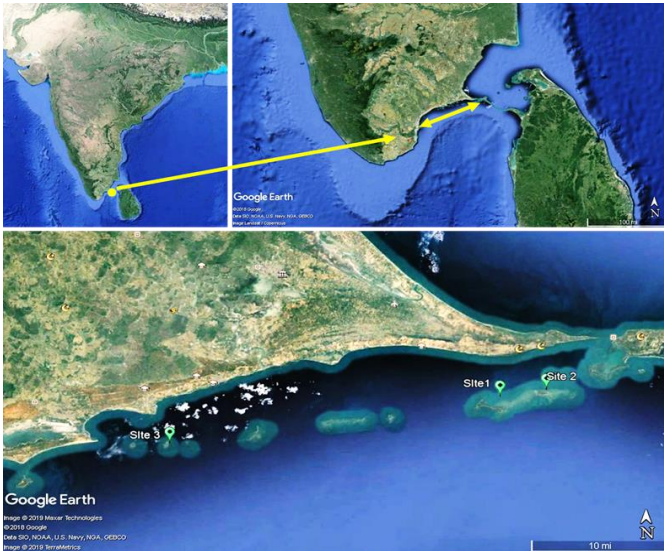
Fig 1: Map showing collection sites of sponge associated brittle stars O. savignyi