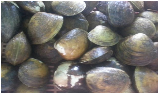
Fig 1: Mangrove Clam ( Polymesoda erosa )