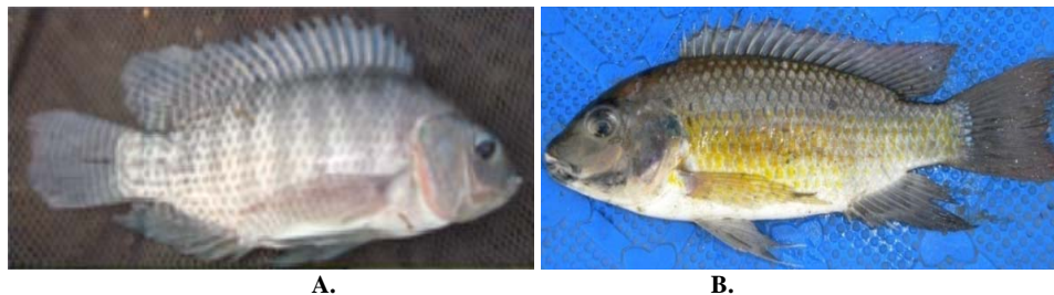
Fig 1: Photo (a) Oreochromis niloticus et (b) Sarotherodon melanotheron

The current study aims to compare the feeding ecology of the invasive Nile tilapia, O. niloticus and the native tilapiine cichlid, S. melanotheron , in order to better document diet composition, resource exploitation, niche overlapping, food competition, and the impacts of the introduction of O. niloticus (Fig 1a) on dominant native tilapia, S. melanotheron (Fig 1b) and on Lake Toho fish community.