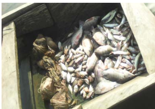
Plate 2: Fisher's catch in a canoe