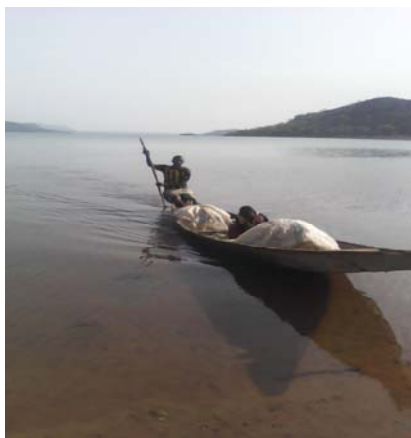
Plate 1: Fisher landing with his catch

2016. Data were collected from the three fishing villages (Tunga Mallam, Anturu and Atara) using structural questionnaires and interviews with 20 randomly selected fishers including the Chief Fisherman for frame survey. Total count and listing of all the fishing villages, fishers and fishing equipment operating on the dam were made. During the catch assessment, fishers' catches at landing sites were also assessed (plates 1 and 2). Fish caught by each fisher randomly sampled were identified using Idowu-Umeh (2003) [4] method of fish identification and sorted according to species and the gear type used. They were counted and their weights taken using weighing balance and recorded on data sheet. The landing prices of all the fish species identified were also recorded.