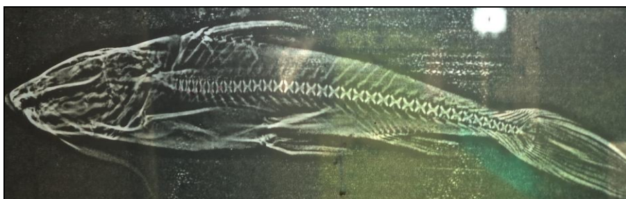
Fig 2: X-ray photograph of normal specimen of Bagarius bagarius (Ham.-Buch.)