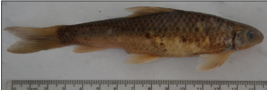
Fig 5: Photograph of a normal specimen of Crossocheilus latius diplocheilus (Ham.-Buch.)