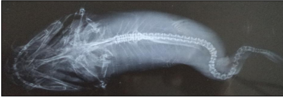
Fig 4: X-ray photograph of deformed specimen of Bagarius bagarius (Ham.-Buch.)