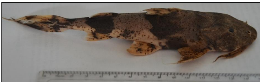
Fig 1: Photograph of a normal specimen of Bagarius bagarius (Ham.-Buch.)