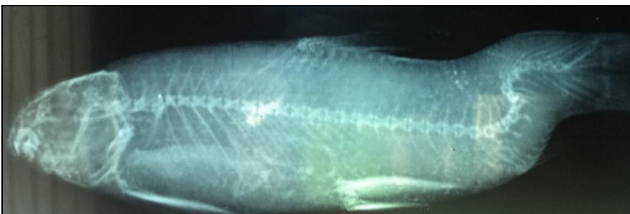
Fig 8: X-ray photograph of deformed specimen of Crossocheilus latius diplocheilus .