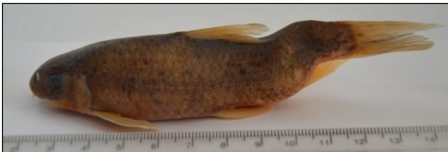
Fig 7: Photograph of deformed specimen of Crossocheilus latius diplocheilus (Ham.-Buch.)