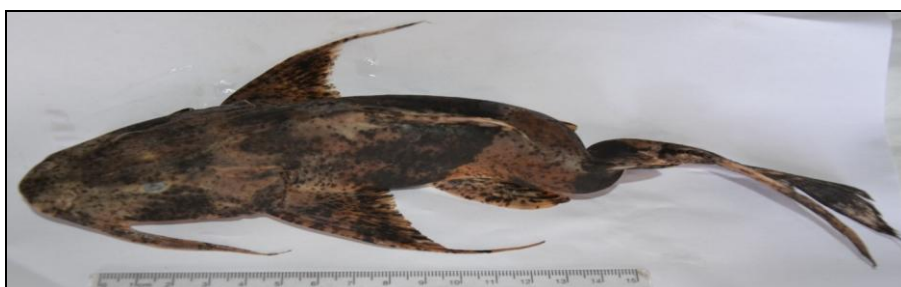
Fig 3: Photograph of a deformed specimen of Bagarius bagarius (Ham.-Buch.)