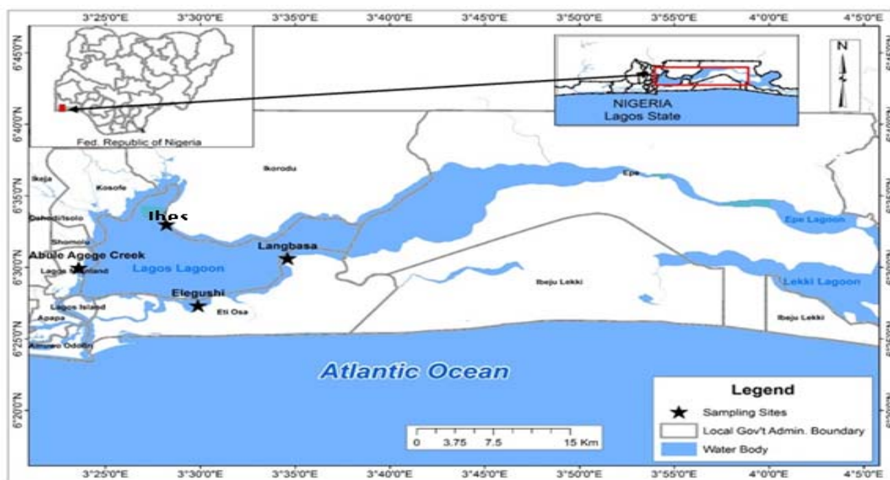
Fig 1: Map of Lagos Lagoon and the study area

Lagos lagoon is the largest lagoon along the coastline. It lies between latitude 6° 26' - 6° 37' N and longitude 3° 23' - 4° 20' E in the western part of Nigeria (Figure 1). The Lagoon is more than 50 km long and 3 to 13 km wide, separated from the Atlantic Ocean by long sand spit (2 to 5 km wide), which has swampy margins on the lagoon side [7] . In this study, four fishing sites of the Lagos Lagoon were selected: Langbasa (N06° 30.618' and E003° 34.608'), Ibeshe (N06° 33' and E003° 28.218'), Elegushi (N06° 27.324' and E003° 29.88') and Abule - Agege Creek (N06° 29.964' and E003° 23.592').