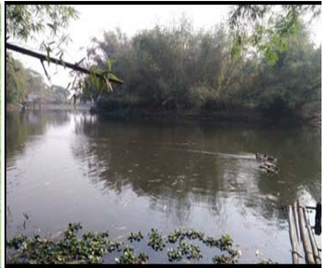
Fig 1(A) and (B): Rukni Anua at Bekirpar.