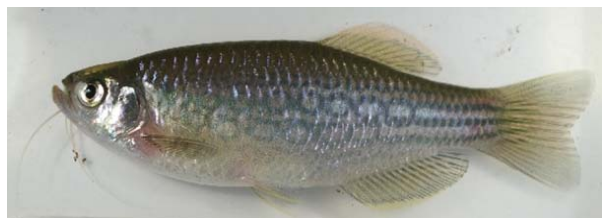
Fig 1: Danio dangila (Hamilton, 1822), Moustached Danio