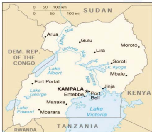
Fig 2: Map showing the five major water bodies in Uganda [17]

About 20% of Uganda’s surface area is comprised of water [12], in addition, Uganda is the fifth largest fishing nation in Africa after Egypt, Morocco, Nigeria and South Africa Hempel [13]. 2010 The fisheries industry in Uganda is largely artisanal based on inland capture fisheries from lakes [14] Victoria, Kyoga, Albert, George and Edward Figure 2 There are about 49 known fish species in the country MWE [15], 2007 though the major commercial species are Nile perch Lates niloticus , Nile tilapia Oreochromis niloticus , Silver fish Rastrineobola argentea , African cat fish Clarias gariepinus , African lung fish Protopterus aethiopicus , moon fishes Alestes baremose , Hydrocynus , Bagrus [12]. In Uganda, the annual fish catch from Lake Victoria has declined from 238, 533 tonnes in 2005 to 183,824 metric tonnes in 2011 [16] yet fisheries resources contributes significant to the economic development of Uganda in terms of food, employment and income. Fish export earnings, mainly from Nile perch, have improved from US$ 5.3 million in 1991 to US$ 83.3 million in 2010; and about 1,000,000 -1,500,000 people are directly or indirectly involved in the fisheries activities [11].