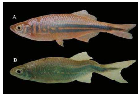
Fig 1: Normal (A) (live) and Deformed (B) (Formaldehyde fixed) specimens of Devario aequipinnatus

When compared to the normal fish the deformed specimen of D. aequipinnatus possessed vertebral abnormality in the post-dorsal fin region. Further the radiological examination has revealed the presence of 35 and 34 vertebrae, in normal and abnormal fish, respectively (Figs.2 A & B). Vertebral column, in the aberrant fish, between 1 st to 12 th vertebrae, formed an arc giving the appearance of a dome. Between 13 th to 27 th vertebrae, vertebral column formed a semi-circular trough, 13 th to 15 th vertebrae formed the anterior limb of trough, 16 th to 25 th vertebrae the bottom and 26 rd to 28 th vertebrae formed the posterior limb of trough. Vertebrae have reduced intervertebral space and vertebral thickness. Posteriorly, vertebral column between 29 th to 34 th vertebrae slightly truncated and vertebral thickness and intervertebral spaces reduced.