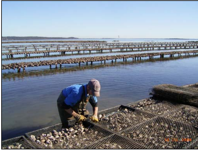
Fig. 1: Tray culture of Oysters

( http://www.holbertsoysterfarm.com/oyster-production.html )