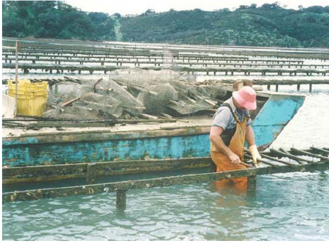
Fig. 5: Oyster farm operations are a source of physical disturbance beneath oyster racks [Photo: 17].