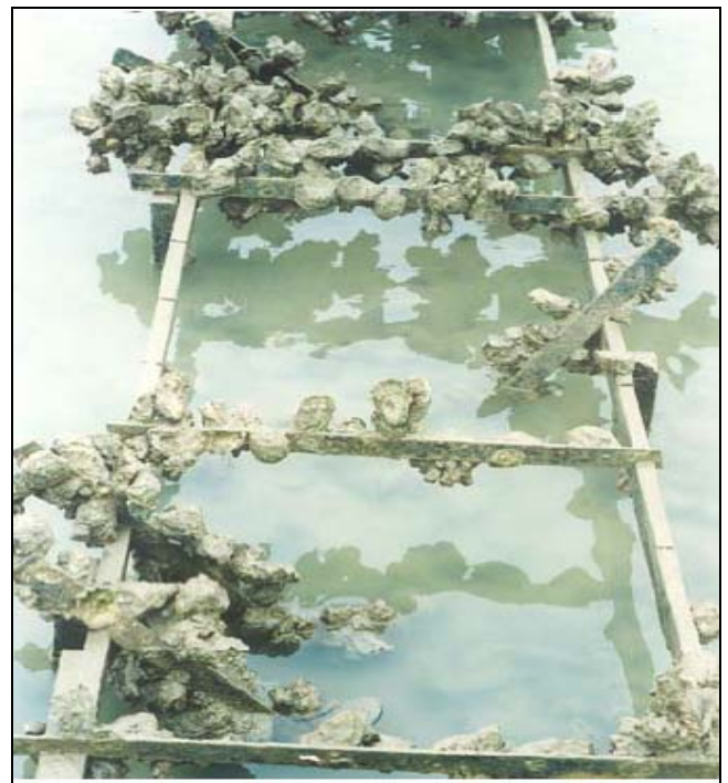
Fig. 3: Sediment accumulation beneath oyster racks. [Photo: 17].

consumer invertebrates as a food resource. Therefore, Oysters may stimulate primary productivity through bio-deposition. They do this by exerting control over the amount of available mineral nitrogen and phosphorus to phytoplankton by sequestering them as protein in their meat and shell tissues [51]. Not only that, they deposit organic nitrogen-rich bio-deposits to the bottom sediments that bacteria decompose, thus forming ammonium; ammonium is converted by nitrifying bacteria in oxygen-rich sediments to nitrate, which denitrifying bacteria in deeper sediment layers then convert to nitrogen gas [34, 43]. Due to bio-deposition by oysters, organic enrichment has been recorded at some sites. [44] described an increase in organic and silt composition of sediment beneath the oysters’ trestles. [38] reported that trestle cultivation of oysters is responsible for increased sedimentation (Figure 3) of both organic matter and contaminants. [55] revealed that the accumulation of bio-deposits by oysters brings about noticeable geological modifications of the underlying sediment. He recorded an increase in the organic, silt and phaeo-pigment content beneath the trestles which was again probably related to the recorded decrease in current velocity at both sites.