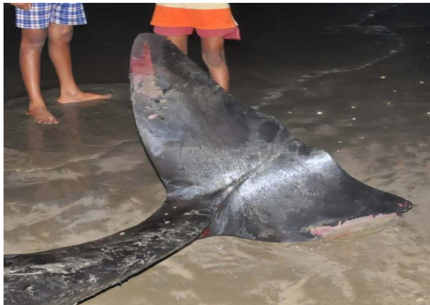
Plate 4: Amputated tail fluke