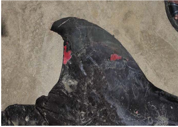
Plate 3: Whale dorsal fin