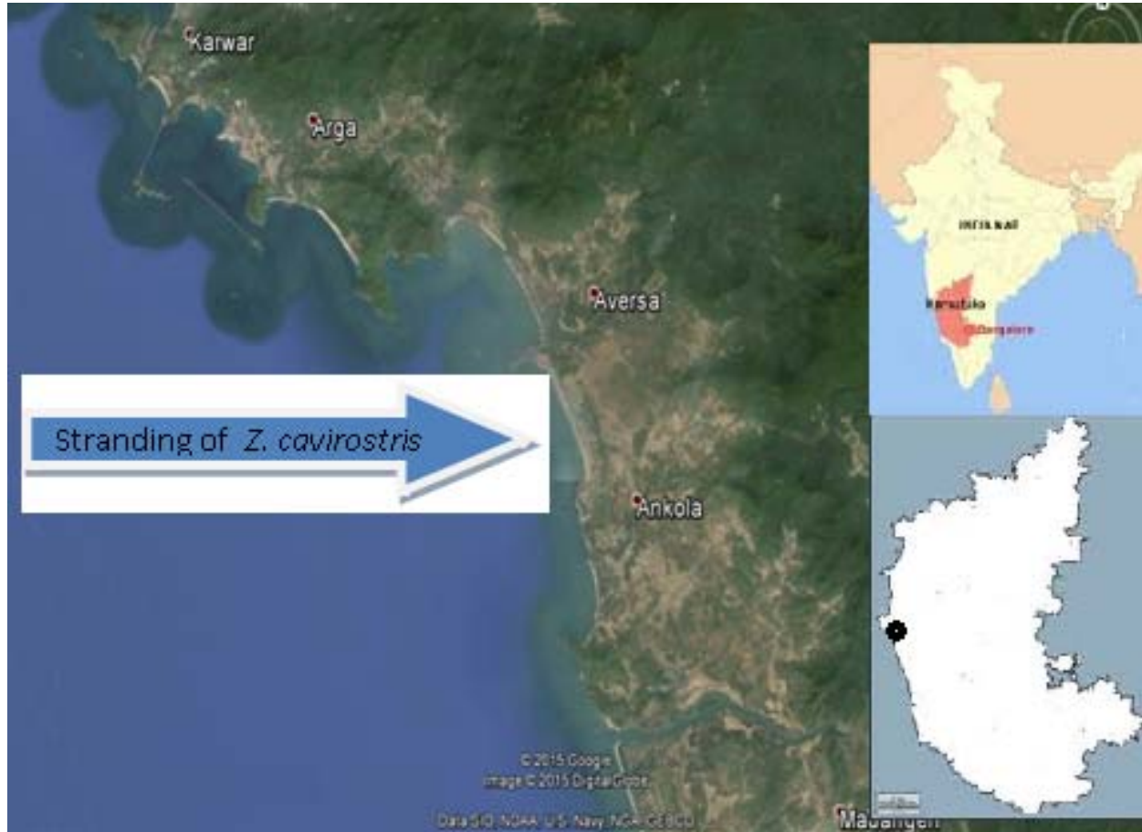
Fig 1: Map showing the location of stranding of Cuvier's Beaked Whale ( Ziphius cavirostris ) at Keni beach.

Mammal identification was done based on the characteristics provided in the American Cetacean Society. The present stranded mammal was identified as Cuvier's beaked whale belongs to class mammalian, order-cetacea suborder – Odontoceti, family-Ziphiidae, genus- Ziphius and species Z. cavirostris . Mammal stranding was first of its kind along the Karnataka coast and probably along western coast shoreline. The earlier stranding record was in 1981 in the Lakshadweep coast [10] at Minicoy Island, Lakshadweep. Other one was at Parangipettai, Tamil Nadu [2] .