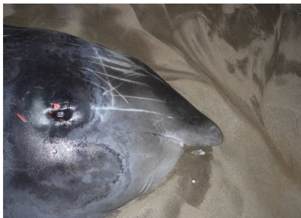
Plate 2: whale head position