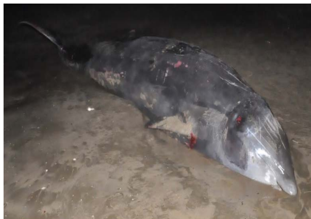
Plate 1: Stranded Cuvier's beaked whale

Current research reveals two species of beaked whales are most affected by sonar: Cuvier's beaked whales ( Z. cavirostris ) and Blainville's ( M. densirostris ) beaked whales. These animals have been reported as stranding in correlation with military exercises in Greece, the Bahamas, Madeira, and the Canary Islands and the livers of these animals had the most damage (en.wikipedia.org).