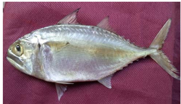
Fig 3: Rastrelliger brachysoma

Three longitudinal stripes present are above the lateral line and three rows of dark band horizontally present with each row varying from 14-16 and present at the centre of the body below 1 st and 2 nd dorsal fin. A prominent dark circular or irregular spot is observed near the pectoral fin. Tip of the 1 st dorsal fin is spinous and slightly greyish in colour. (Fig 2).