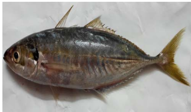
Fig 2: Rastrelliger kanagurta

The morphometric measurements of Rastrelliger kanagurta as shown in Table 1, shows that head constitutes 24.6 % and body depth constitutes 22.2 % of total length. Another characteristic feature of Rastrelliger kanagurta is that the length of the head is greater than body depth and eye diameter is 24.3 % of the head length.