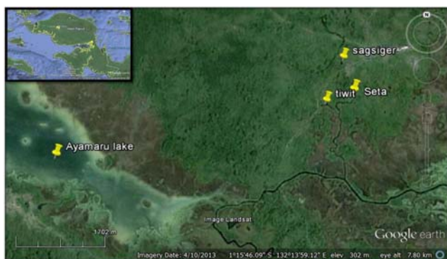
Fig 1: Sampling sites

Fish samples consist of 93 female M. boesemani that caught at three sampling sites i.e Seta (132° 15' 17. 215" E and 1° 15'64.457" S), Tiwit (132° 14'99.91" E 1° 15'45.475" S) and Sagsiger (132° 15'19.257" E and 1° 14' 97.111" S) (Fig 1:). Fish samples were caught using handnet with 2 metre opened and 1 cm mesh size. Fish samples body weight were measured then dissected to determine ovary maturation stages. Fish samples preparation were done at Research and Development of Freshwater Fish Aquaculture Installation, Sorong Fisheries Academy, then processed histologically at Pathology and Anatomy Laboratory, Faculty of Medicine, Brawijaya University. All treatment on fish samples have been approved by Animal Care and Use Committee of Brawijaya University No. 135-KEP-UB. The fish sampling were done once a month for 5 months (June to November 2013) excluding Oktober.