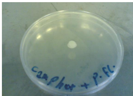
Fig 3: P. fluorescens in disc diffusion method

Disc diffusion method was done to check bacteria's susceptibility towards C. camphora , specifically of P. fluorescens . As observed from Figure 3, there was no inhibition zone. To the best of our knowledge, there have not been many studies investigating the effectiveness of camphor against fish-related fungi, therefore justifying results of the experiment.