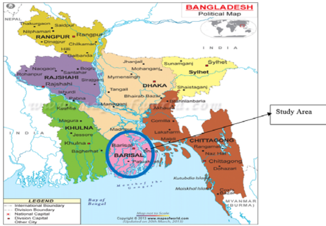
Fig 1: Map of Bangladesh and South-Central region encircled the study area