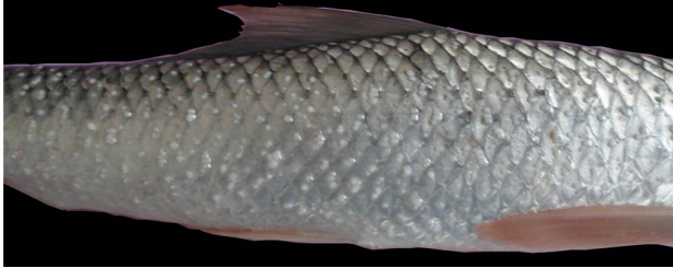
Fig 1: Photograph showing Ichthyophthirius sp. on body surface of C. mrigala .

among the carps farms was estimated BDT 12,568 - 62,571 ha -1 yr -1 . Total economic loss was found BDT 35,552.50 (US$ 444) {35,552.50 ± 5,506.46 (mean ± SE)} ha -1 yr -1 due to parasitic diseases (Table 2). However, overall loss due to parasites diseases were found 11% for carps mortality, 11% for chemicals or drugs cost and 65% for reduction of carps growth in the study areas (Fig 3).