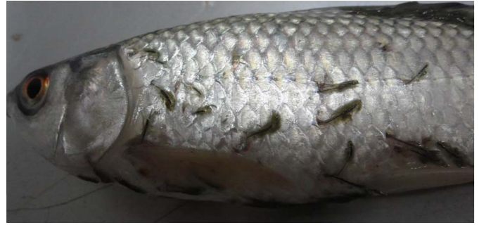
Fig 2. Photograph showing Larnaea sp. on body surface of L. rohita .