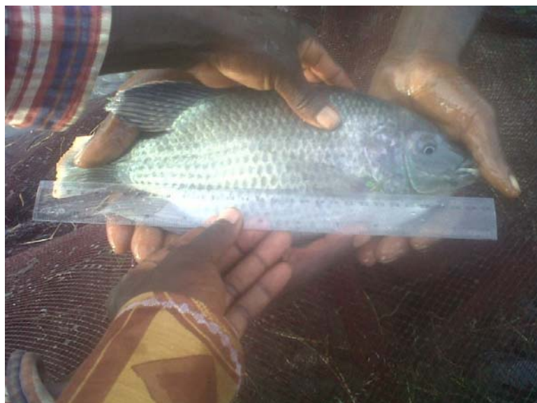
Fig 2: Oreochromis macrochir raised from the Kambashi cages in 240 days, weighing 350 g and total length of 28 cm