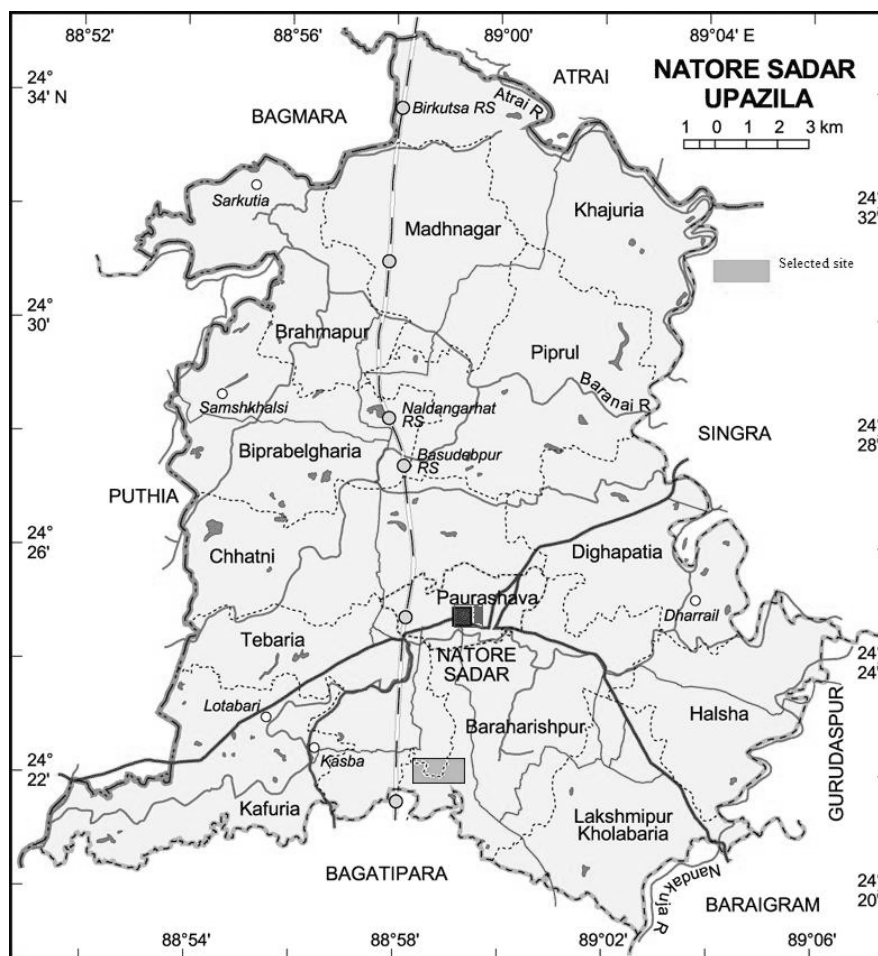
Fig. 1: Map of Natore Sadar Upazila showing study area

The research was carried out at the Banbelgharia, the Government fish seed production farm, Natore Sadar Upazila under Natore district, Bangladesh (Figure 1) for a period of 3 months (April to June, 2012) in six experimental fish ponds. Each pond has inlet for watering but no outlet. The ponds were dependable on rainfall and deep tube well water.